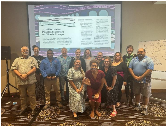
Members of the co-design group, core and project teams, and Maori colleagues in Gimuy/Cairns, 2023

A collective of Indigenous co-design members are collaborating to establish an Indigenous-led Digital Climate Story Platform. The concept and collaborations for the Climate Stories Platform emerged through the 2018 First Peoples Gathering on Climate Change on Yorta Yorta Country, Barmah Forest and on Gimuy-walubarra yidi Country, Gimuy (Cairns). This work connects with the Steering Committee of the First Peoples' Gathering on Climate Change.