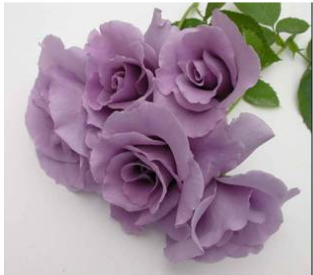
The blue rose – developed using CSIRO's hairpin RNAi.

CSIRO first developed gene silencing, or hairpin RNAi, in 1997. It was a significant breakthrough allowing scientists to turn down or switch off completely the activity of genes.