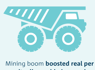
capita disposable income by 13 per cent from 2000 to 2013 (45% of total growth)<sup>1</sup>

In light of this rapid pace of change, how will Australia maintain competitiveness in existing industries and build comparative advantage in new and emerging industries?