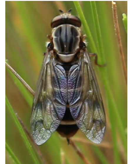
Exeretonevra maculipennis Macquart

We collected predominantly in the Polblue, Little Murray, Junction Pools and Paddy's Creek areas of the park at altitudes up to around 1,500 metres and found a range of interesting insects (beetles, moths, katydids, etc) and significant numbers of Diptera (flies) many of which will improve on our ANIC material currently held. As an example, the fly families included Stratiomyidae (soldier flies), Tabanidae (horse flies), Bombyliidae (bee flies), Nemestrinidae, Xylophagidae, Syrphidae (hover flies), Asilidae (robber flies), Tachinidae (tachinids), Empididae, Tipulidae, and Micropezidae.