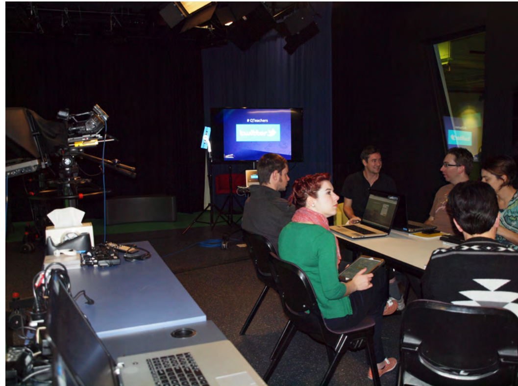
Questacon virtual classroom