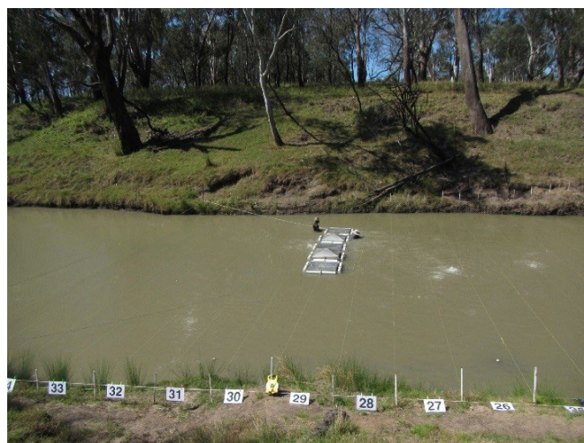
Scientists measuring methane gas using rising chambers from Condamine River