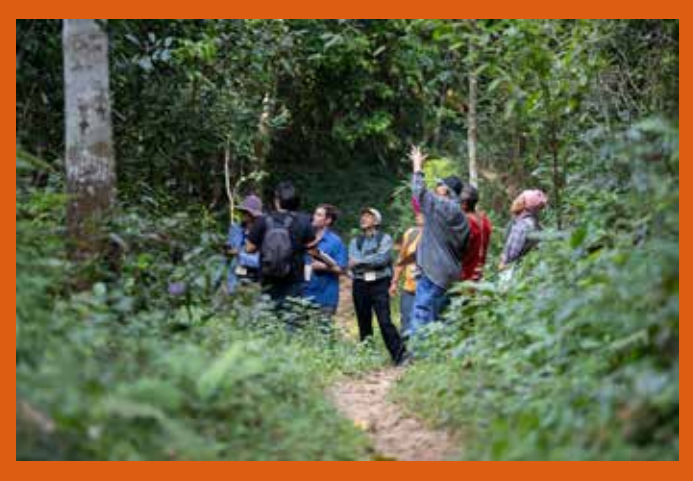
Experts sharing information walking through the landscape talking together in Thai, English and Karen, with ongoing translation.

When the bees fly, they fly better together and look after each other and the interest of the whole community of bees. They live in harmony together and increase the biodiversity in the forest with their actions, like we do. Our community has been revitalizing our forest since it was heavily damaged by the logging concession in the 80s. We are requesting the government to recognize the rights of the Karen people to continue our customary and sustainable use of biodiversity.