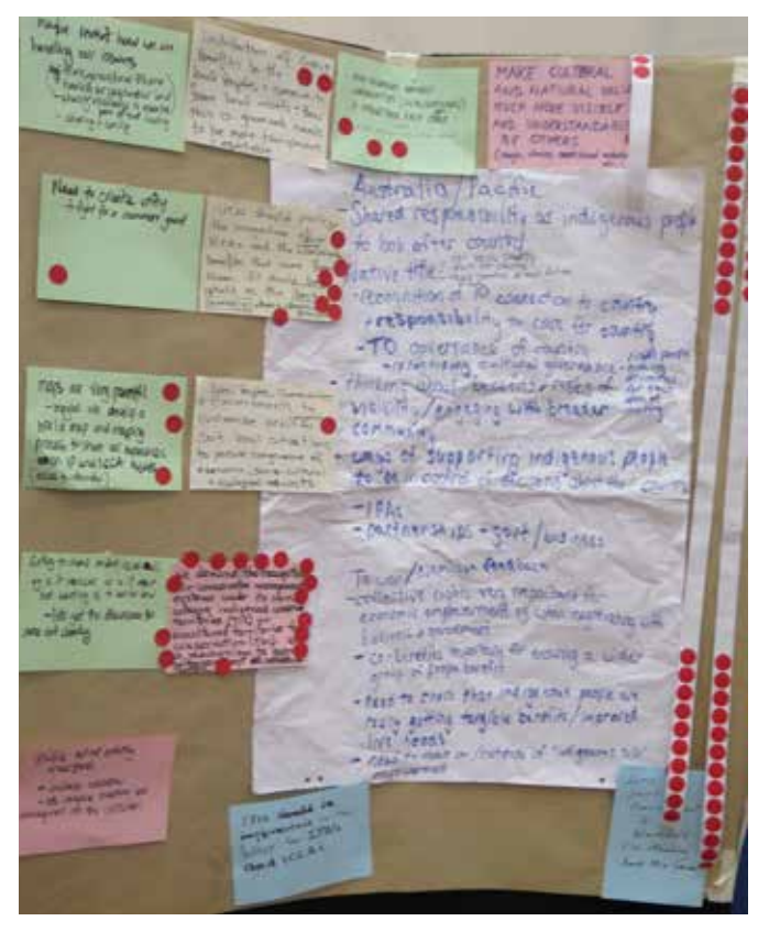
Figure 4.6. Drafting a collective statement at 'Communities conserving nature and culture – A gathering among Indigenous Peoples and local communities from five continents. 9-11 November 2014'.

Our ideas about the links between nature-culture and culturenature are getting more attention internationally. IUCN started a Nature-Culture Journey<sup>bg</sup> at their 2016 World Conservation Congress and ICOMOS continued it with a Nature-Culture journey at their General Assembley in 2017. The focus on understanding how relationships between people and the natural environment shape both our physical environment and belief systems is welcome, given the history in international intergovernmental arenas of treating nature and culture separately.