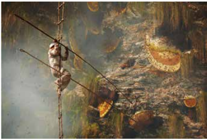
Figure 4.8. Gurung man collecting the Apis dorsata laboriosa honeycombs on cliffs in Nepal.

The Assessment highlighted many pollinator-friendly practices of Indigenous Peoples and local communities, such as totems, sacred places, home gardens, rotational cropping and fallows. The Assessment highlighted that Indigenous Peoples and local communities have many unique practices to keep bees – by far the most important food pollinator – and collect honey, like the Gurung people of Nepal whose innovative rope ladder technology allows them to harvest honey from wild honey bee colonies, rather than moving them to hives (Figure 4.8).