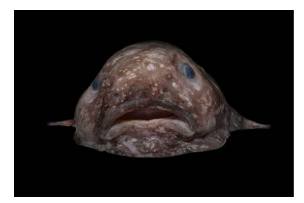
IN2017_V03: Blob fish, Rob Zugaro.

With the extensive mapping undertaken in the Commonwealth Marine Reserves, the voyage also delivered significant impact to key end users, not to mention some amazing pictures.