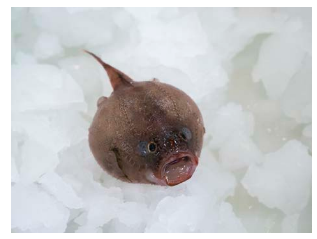
IN2017_V03: Coffin Fish, Asher Flatt