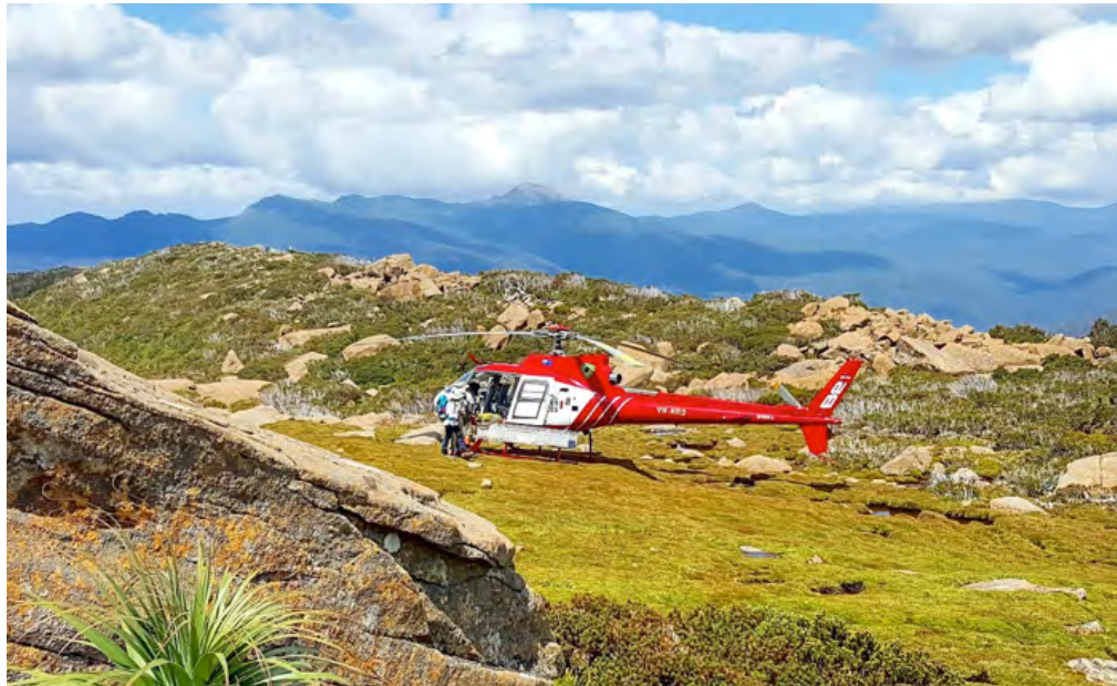
Hitching a ride in the helicopter to Mt Picton