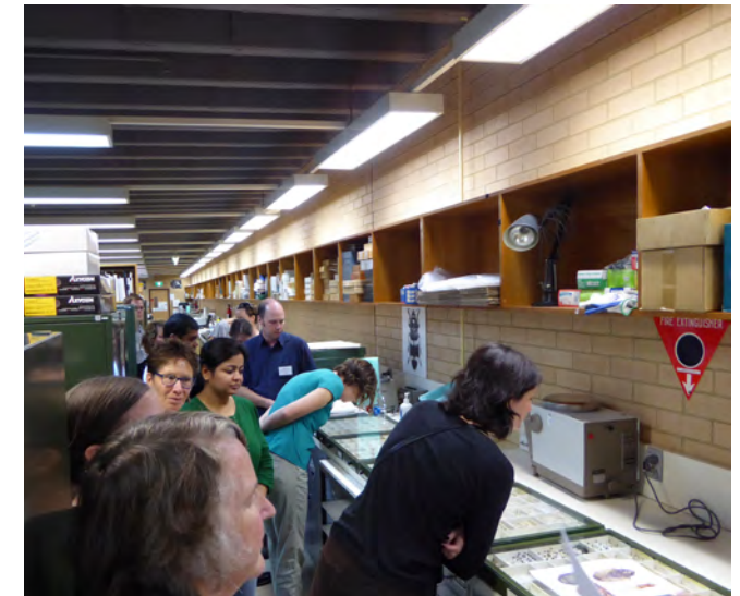
Workshop participants look at the small and often not particularly striking species of insects which are often the most important ones for trade and biosecurity rather than the larger, more readily-noticed species

The workshop covered different types of physical and molecular specimens, images, database records and the relationships between them all. Sessions focused on the practical issues of preparing specimens, labelling them, photographing them, storing them, monitoring them for pests and deterioration and transporting or shipping them to other collections. Other sessions covered nomenclature for different groups of organisms, as well as name changes and how to