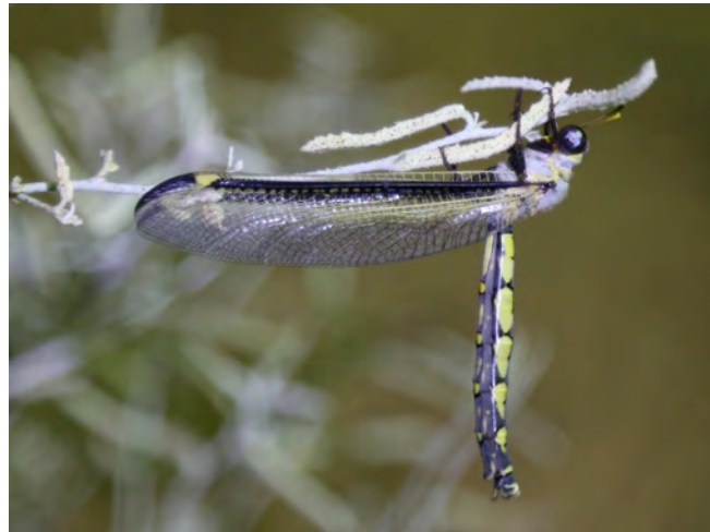
Adult Stilbopteryx sp. at rest

often indistinct tyre track made by a vehicle that had only just successfully got through to a neighbouring station - with many detours around impassable areas and getting in and out of our vehicle in over 40 degree heat, mud and unusually high humidity to double-check the way ahead. It was comforting to some extent to know that (if required) we had a two-way radio in the vehicle, as well as satellite phone, Spot 3, GPS, personal locator beacon, compressor, generator, jump starter, well stocked field first aid kit, full vehicle recovery equipment and food and drink for at least a week, along with all our collecting equipment.