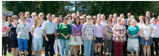
The course attracted a large number of participants

The demand for the workshop was so great that people were turned away. But the 65 lucky participants included commonwealth and state government employees, private consultants, university researchers and students from all over Australia, New Zealand, Fiji and the Solomon Islands.