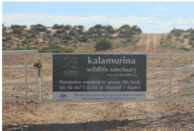
Front gate of Kalamurina property