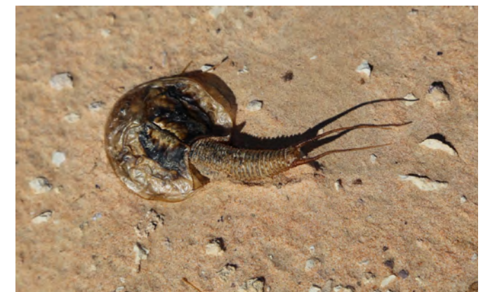
Shield Shrimp

Collecting was predominantly on the sand dunes, open plains, and drying watercourses and included a range of insects and other arthropods, including beetles, moths, lacewings and antlions (Neuroptera), large scorpions, wasps, grasshoppers, stick insects and crickets and some Diptera (flies) many of which will improve and expand ANIC holdings and complement research programs. A number of interesting and potentially new Bombyliidae (bee flies), Asilidae (robber flies), a Buprestid beetle apparently not previously seen in the area, a profusion of Sphingidae (hawk moth), Geometridae (including an undescribed moth of the Hypobapta genus), interesting oecophorid moths and a primitive braconid wasp of the genus Megalohelcon are just some that await further study. An unexpected find was the remains of large shield shrimps along the margins of dried freshwater lakes (see photograph below).