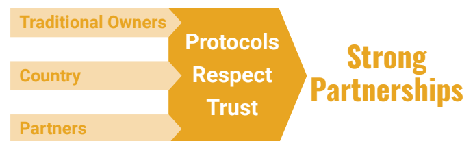
Figure 5.3. Key elements of good partnerships.

Further, to engage meaningfully requires effective communication between partners, which can be complex in cross cultural contexts. Where partners don't speak the same mother tongue, the complexity increases, and the potential for miscommunication and misunderstanding shouldn't be underestimated.