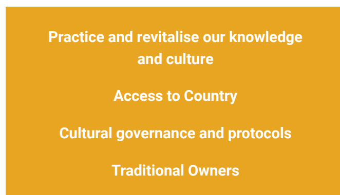
Figure 5.2. Foundations for strengthening Indigenous knowledge.