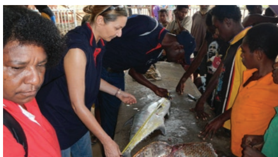
Project team sampling catch in Daru market (J. Posu)

Between 2011 and 2014 AFMA and the PNG NFA funded CSIRO to investigate the status of small-scale fisheries, livelihoods and food security in the Papua New Guinea villages bordering the Torres Strait of Australia. These 'Treaty villages' share marine resources with Australia in a Protected Zone managed under the Torres Strait Treaty. Trends were analysed by making comparisons with data collected by CSIRO in 1995.