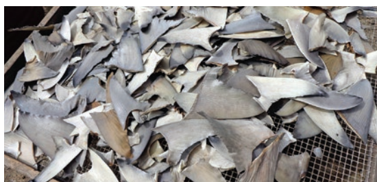
Shark fin