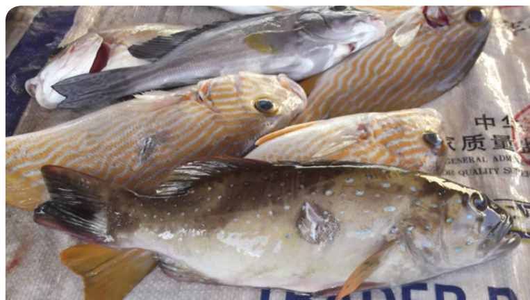
The highest volume sold in Daru market is reef fish (S. Busilacchi)