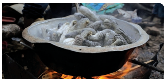
Bêche-de-mer being processed (T. Greenwood)