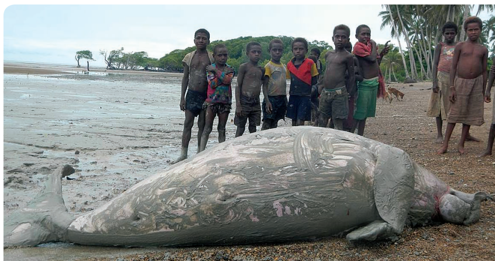
Dugong from a shark net (S. Busilacchi)