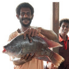
Exotic tilapia are increasingly important food (S. Busilacchi)