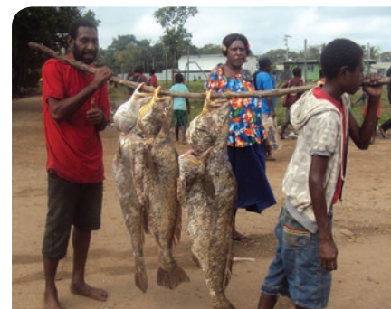
Bladders from jewfish are sold to Indonesia