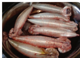
Swim bladders (S. Busilacchi)