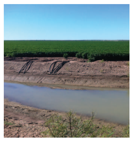
Irrigated cotton in north Queensland.

If you are interested in participating or have any questions about this research, you can contact Neville by telephone or email using the contact details below.