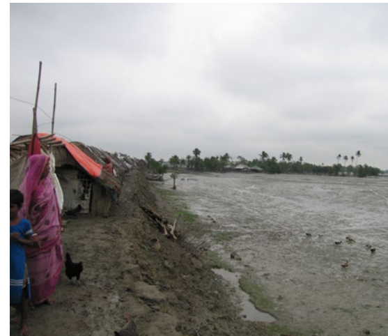
The Bangladesh Integrated Water Resources Assessment has identified key challenges for Bangladesh in future water use and management

In addition to the concerns for drinking and irrigation water, declines in groundwater levels suggest that there will be less dry-season discharge from groundwater to the rivers and/or more wet-season recharge of groundwater from the rivers. This means that during the dry season, low river flows could potentially fall further with the reduction of baseflow.