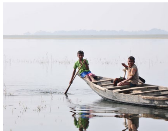
Climate change may affect many aspects of water availability and use including river flows and flooding