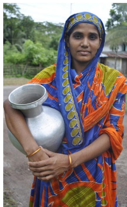
Access to safe drinking water is a key concern for Bangladesh

The project helped build capacity in Bangladesh organisations for integrated water resources assessment, including assessment of socio-economic impacts of climate change and future water demand due to population growth.