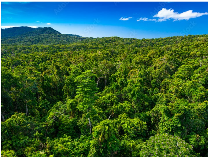
The Nature Repair Market will make it easier for private finance to invest in repairing and protecting biodiversity across Australia.

As Australia's national science agency, CSIRO is solving the greatest challenges through innovative science and technology. CSIRO. Creating a better future for everyone.